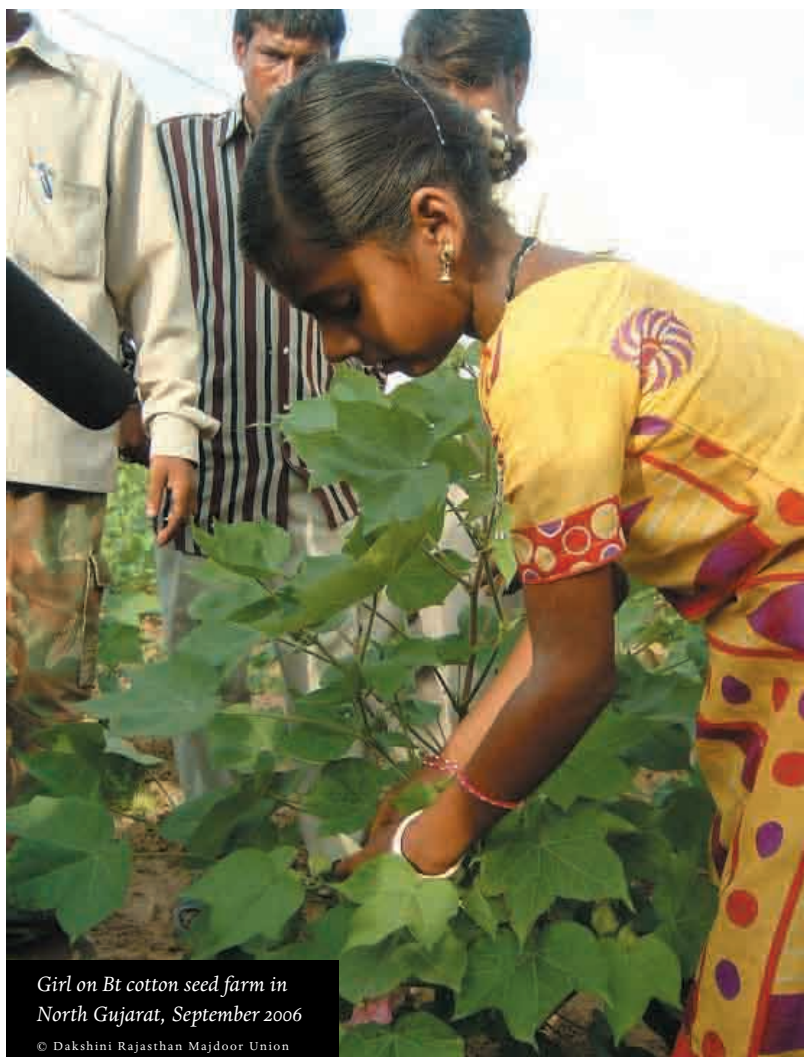
Girl on Bt cotton seed farm in North Gujarat, September 2006

Physical beatings and threats routinely accompany the work in many cotton fields. Under these conditions, children are unsurprisingly intimidated into staying on farms, fearful of the consequences of trying to leave. In Uzbekistan, those who fail to meet state-imposed quotas, or pick poor-quality cotton, experience verbal or physical abuse, detention, or are told that their school results will suffer 41 ; physical abuse is common for children across West Africa 42 . Girls in India, Pakistan and China have been reported to suffer sexual harassment and even rape 43 . A recent exposé by India's TIMES NOW television channel, of child trafficking from Rajasthan to Gujarat's Bt cotton fields, featured horrific accounts of abuse from children they encountered 44 . Sexual exploitation of young girls in the fields – reportedly by farm owners, their relatives or co-owners of the farms – is said to be 'rampant', and largely unreported 45 .