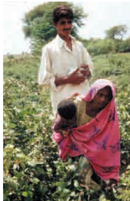
ABOVE: Many poor Hari families, exploited by powerful landowners, are exposed to temperatures of up to 50 °C as they work long hours in Pakistan's cotton fields.