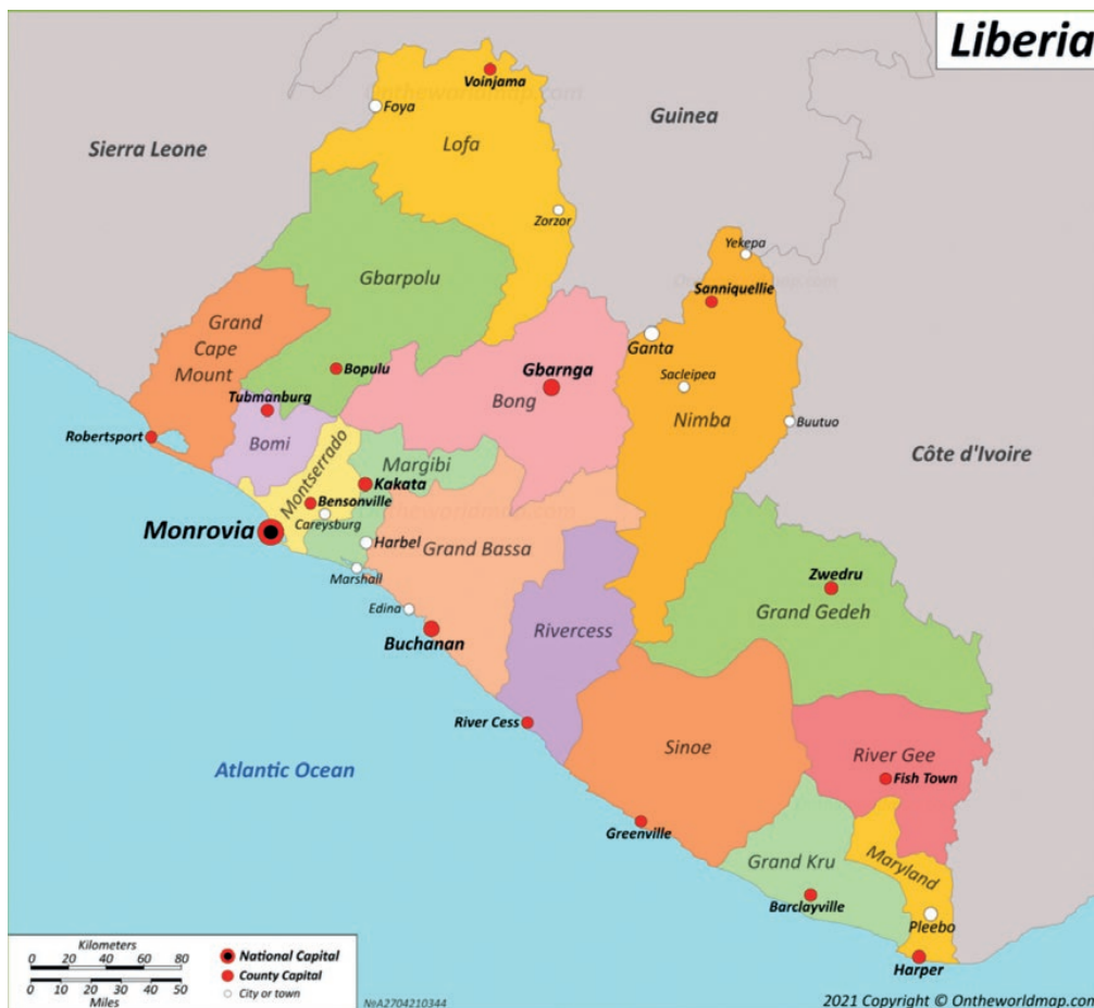
Figure 1: Political map of Liberia ( https://ontheworldmap.com/liberia/ )

fisheries, artisanal inland fisheries, and aquaculture, which is still in its infancy. Foreigners dominate the industrial and marine fisheries, 26 and locals dominate the inland fishing, mainly undertaken on the country's six major rivers and two lakes. 27