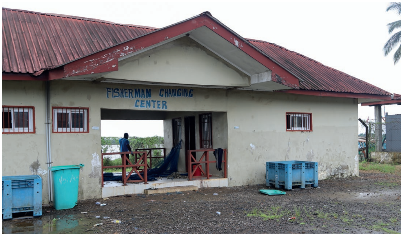
Fishermen changing centre at the Robertsport Fish Landing Cluster.