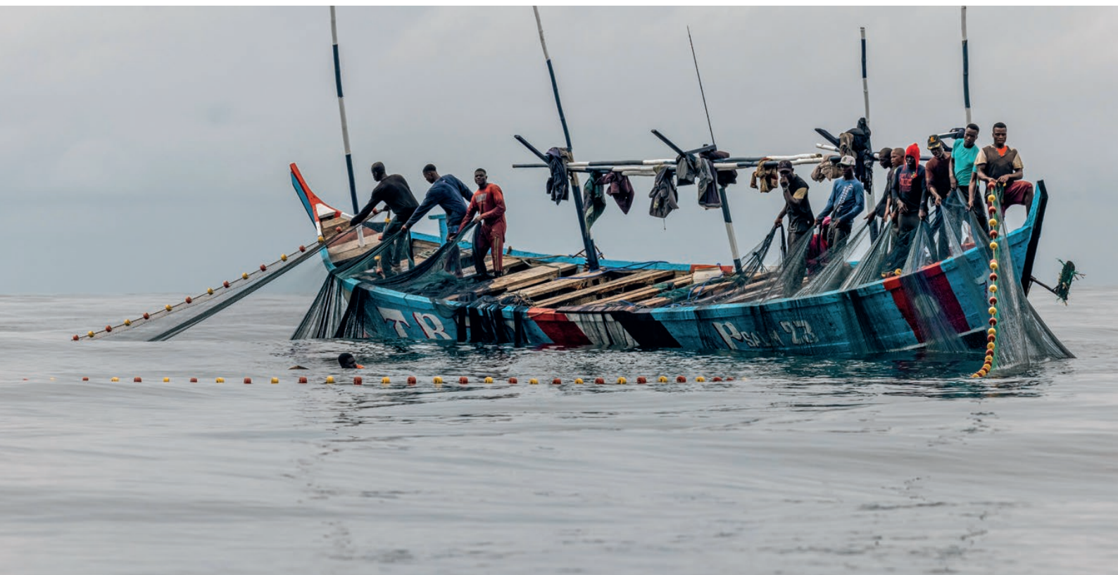
Fishermen pulling in their fishing net at sea.

This report reviews the achievements, challenges, and significant lessons of the first CMA to be established in Liberia – the Grand Cape Mount County CMA. It identifies the main barriers to effective co-management in Liberia and makes recommendations to address the issues identified. The findings are intended to inform options to scale-up the establishment of CMAs to better manage Liberia's coastal and inland fisheries resources, as well as ongoing efforts to improve the effectiveness of the existing CMAs in the country.