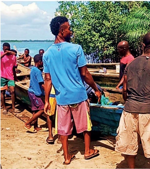
Fishermen preparing for a rescue mission.