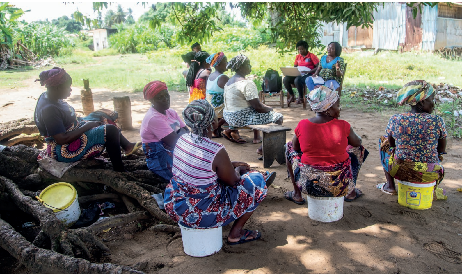
Fishmongers and processors in a meeting on the beach.